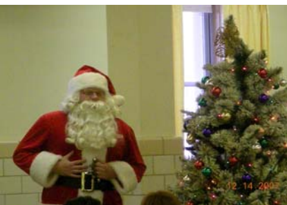
Above: A special guest; Right: Room 209B enjoying pizza.

December festivities included lunch with members of the Illinois Crime Prevention Association. This organization is comprised of individuals who represent different police departments from throughout the northern Illinois district. PTO sponsored and served lunch while students and their guests enjoyed a visit from Santa and sang Christmas carols together.